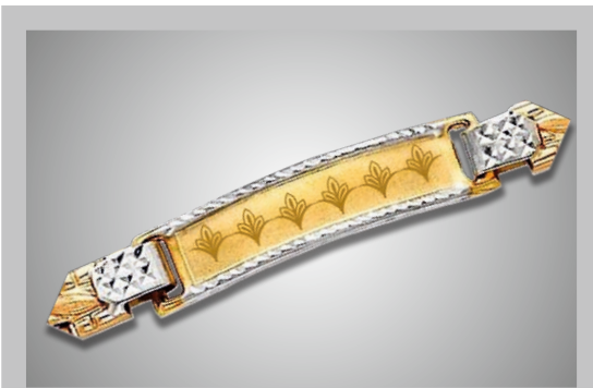
Marking on Jewellery