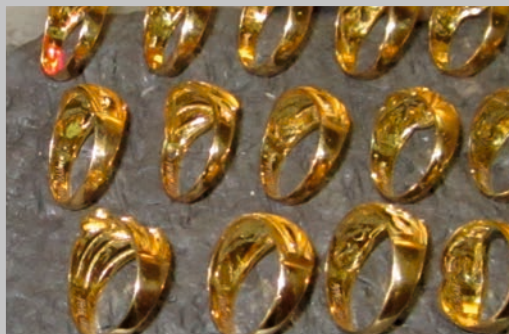
Hallmarking on jewellery