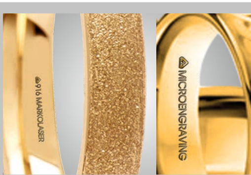
Hallmarking on jewellery