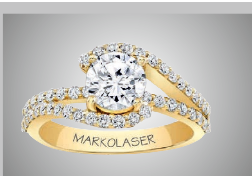
Personalization on Jewellery