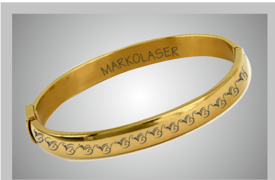
Laser Designing on Jewellery