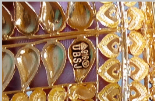
Hallmarking on jewellery