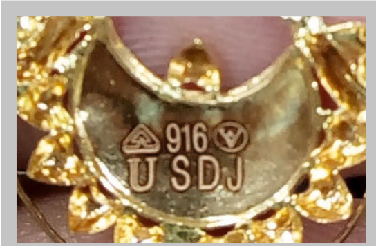
Hallmarking on jewellery