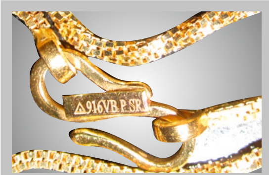
Hallmarking on jewellery